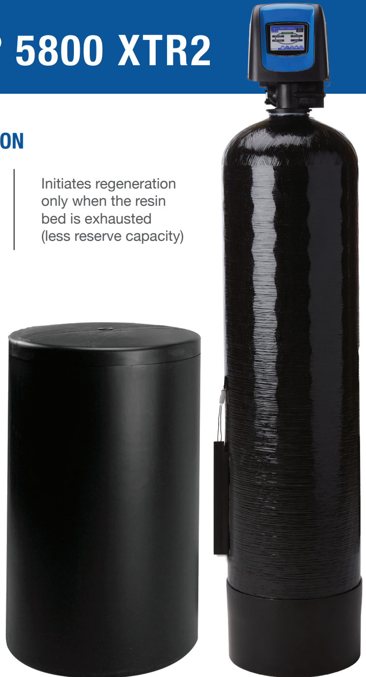
Brine tank and bezel sold separately

Protect pipes and appliances from hard water with an automatic sensor regeneration that keeps hard water from entering your home, providing you with a consistent flow of soft water, regardless of usage patterns.